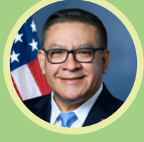
Congressman Salud Carbajal (CA-24)