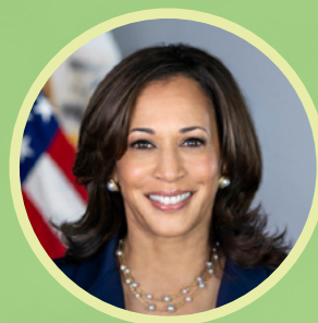
Vice President Kamala Harris