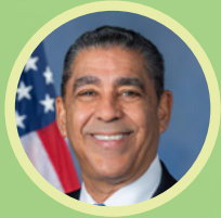
Congressman Adriano Espaillat (NY-13)