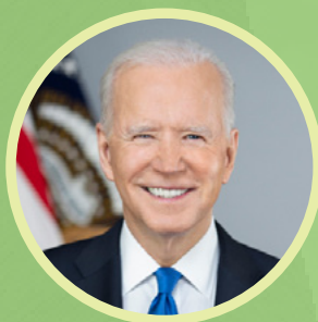
President Joe Biden