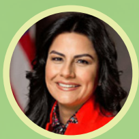
Congresswoman Nanette Barragán (CA-44) CHCI Chair

Throughout 2022, Members of the Congressional Hispanic Caucus (CHC) engaged with CHCI in various ways. Here are some of the most active Members: