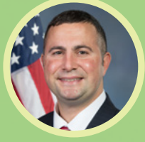
Congressman Darren Soto (FL-09)