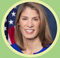
Congresswoman Lori Trahan (MA-03)