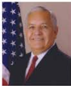
2001-2002 HON. SILVESTRE REYES