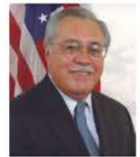
1995-1996 HON. ED PASTOR