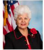
2005-2006 REP. GRACE F. NAPOLITANO