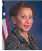
2009-2010 REP. NYDIA M. VELÁZQUEZ