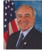
2007-2008 HON. JOE BACA