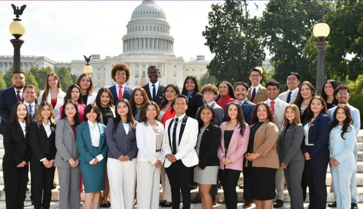
2024 FALL CONGRESSIONAL INTERNS