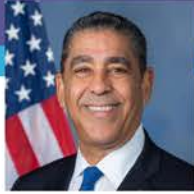
Rep. Adriano Espaillat (NY-13) CHCI Board Chair