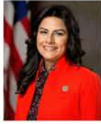
2021-2022 REP. NANETTE BARRAGÁN