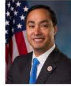
2017-2018 REP. JOAQUIN CASTRO