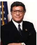
1986-1987 HON. ESTEBAN TORRES