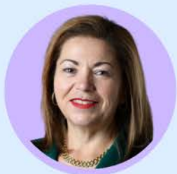
REP. LINDA T. SÁNCHEZ (CA-38)

CHCI would like to recognize and thank the Hispanic Heritage Month Advisory Committee members for volunteering their time and leadership, which has helped shape another exceptional Leadership Conference and Annual Awards Gala.