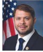
2019-2020 REP. RUBEN GALLEGO