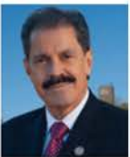
1993-1994 HON. JOSÉ E. SERRANO