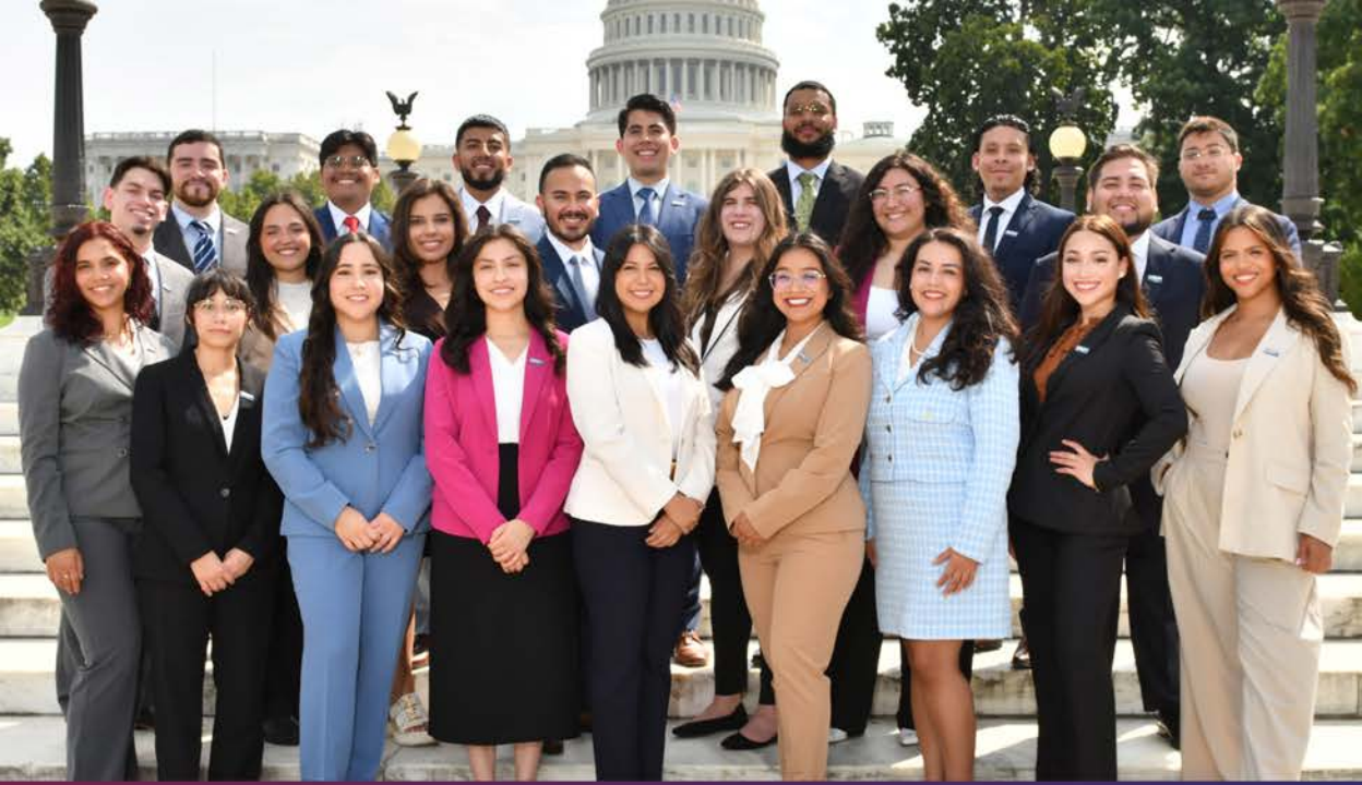
2024-2025 PUBLIC POLICY AND POSTGRADUATE FELLOWS