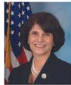
1999-2000 HON. LUCILLE ROYBAL-ALLARD