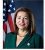
2015-2016 REP. LINDA T. SÁNCHEZ