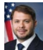
Rep. Ruben Gallego CHCI Chair