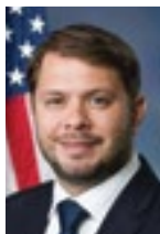
2019-2020 Rep. Ruben Gallego