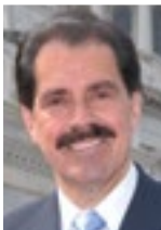
1993-1994 Rep. José E. Serrano