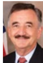
2003-2004 Hon. Ciro Rodríguez