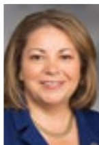
2015-2016 Rep. Linda T. Sánchez