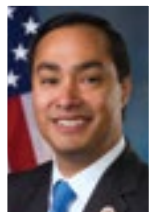
2017-2018 Rep. Joaquín Castro