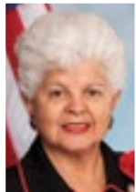
2005-2006 Rep. Grace Flores Napolitano