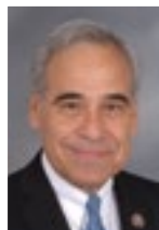
2011-2012 Hon. Charles A. Gonzalez