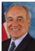
2007-2008 Hon. Joe Baca