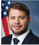
Rep. Ruben Gallego CHCI Chair