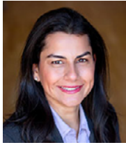
Rep. Nanette Diaz Barragán (CA-44) CHCI Chair