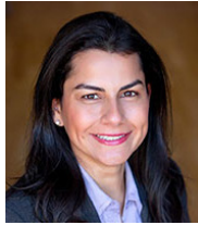
Rep. Nanette Diaz Barragán (CA-44) CHCI Chair